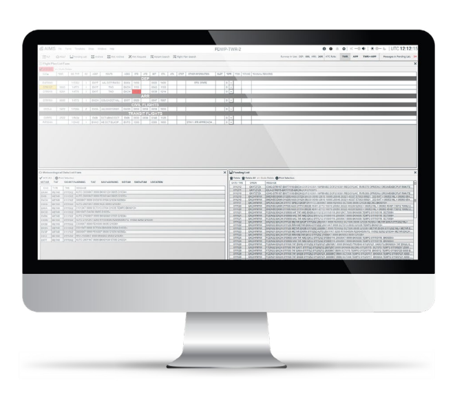
Real-time, unified flight plan and meteorological data

The flight plans from Insero AIMS are also available in the Insero E-STRIP electronic flight strip application.