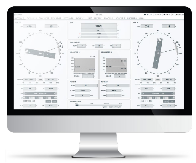
Real-time, unified weather information

Insero AWOS is developed in accordance with EURO-CONTROL, EASA, ICAO, and WMO regulations and standards.